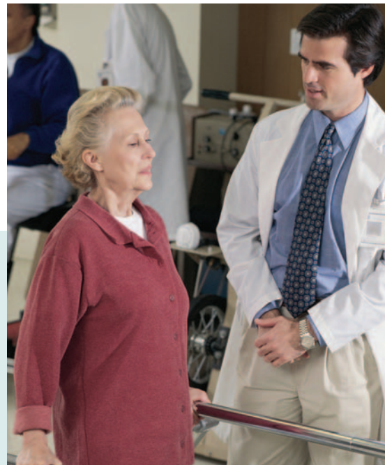
(right) Deaconess Long Term Care residents are offered physical, occupational and speech therapy individualized to meet the special needs of our residents. Some DLTC facilities feature separate rehab units for short-stay guests who are efficiently “rehabbed to home,” often following orthopedic surgery or stroke.

facilities who serve the behavioral population. The Skills for Life Program reinforces positive behavior to help both residents and staff meet goals that foster self reliance. The program quickly gained credibility with appreciative referral sources.